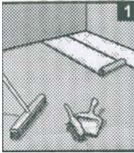
Figure 1: Thoroughly clean the subfloor and roll the underlayment out if it is not made to act as a vapor barrier then a 6 mil Polyethylene plastic film should be laid first. Overlap the seam area of the film 6 to 8 inches, and tape with clear plastic sealing tape. Follow the instruction included with the underlayment.