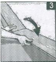
Figure 3: Insert the end section of the next plank at an angle and press down to get a flat adjoining surface. Continue this process to the end of the first row.