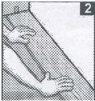
Figure 2: Commence installation in the left hand corner. Use shims to allow about 1/4" between the planks and the walls, or stationary interior room objects, so that there is room for normal expansion and movement.