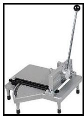
Figure 5: We recommend a laminate cutter if available. If you are using a saber saw, or other type of power saw, place the plank face down on the work area and cut to size. If you are cutting with a hand saw, use a fine tooth blade and cut the plank with the face up. Insert the cut plank into the row; use a crowbar to ease the plank into position.